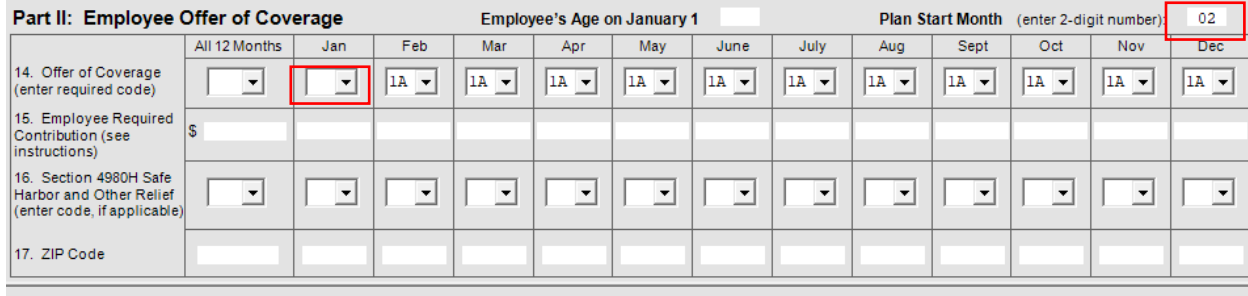
Official 1095-C IRS Instructions

Plan Start Month is 02 (Feb) but you still need to have data/code in month of (Jan).